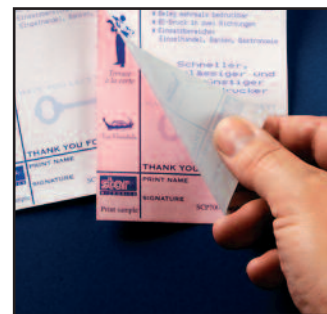
Original + 2 Copies