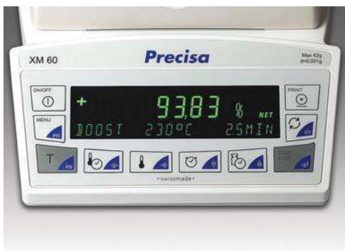
Menu-driven, screen-guided applications