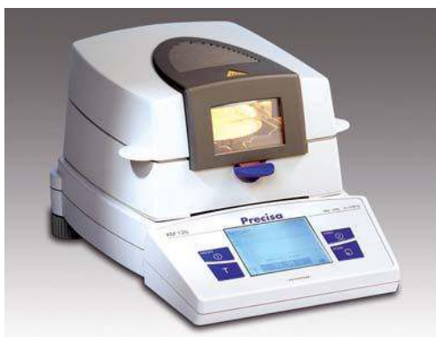
Compactly styled design