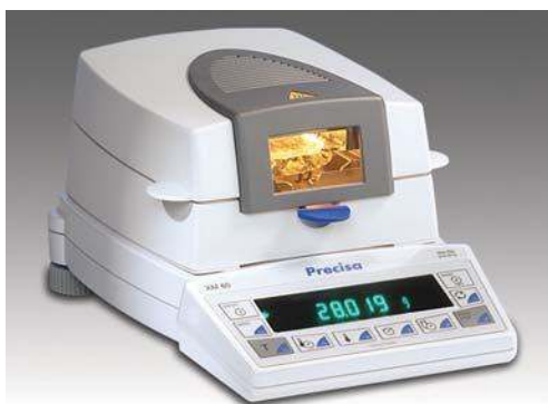
Robust and simple to operate