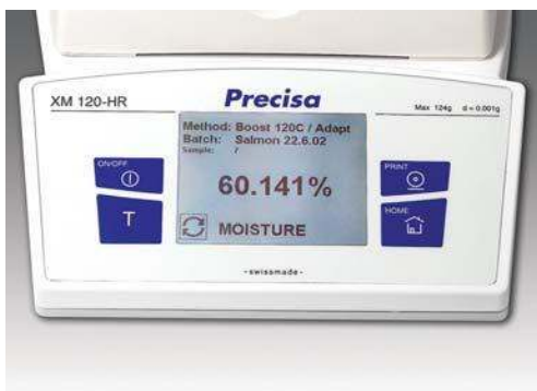
Outstanding Touch Screen Display