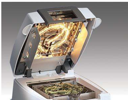
Easy sample access