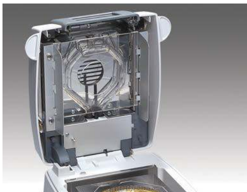
3 different radiation heat sources are optional